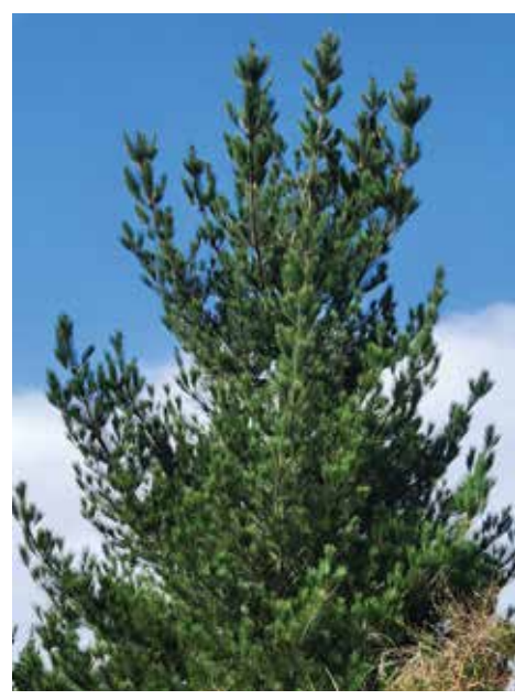
Boron helps ensure apical dominance (left), which means a strong trunk and less branching. A deficit of boron results in a loss of apical dominance (right), a dumpy multi-leader tree with heavy branching

dieback, resulting in a multi-leader tree which lacks apical dominance in the butt log. It can also make trees more susceptible to fungal attack," she says.