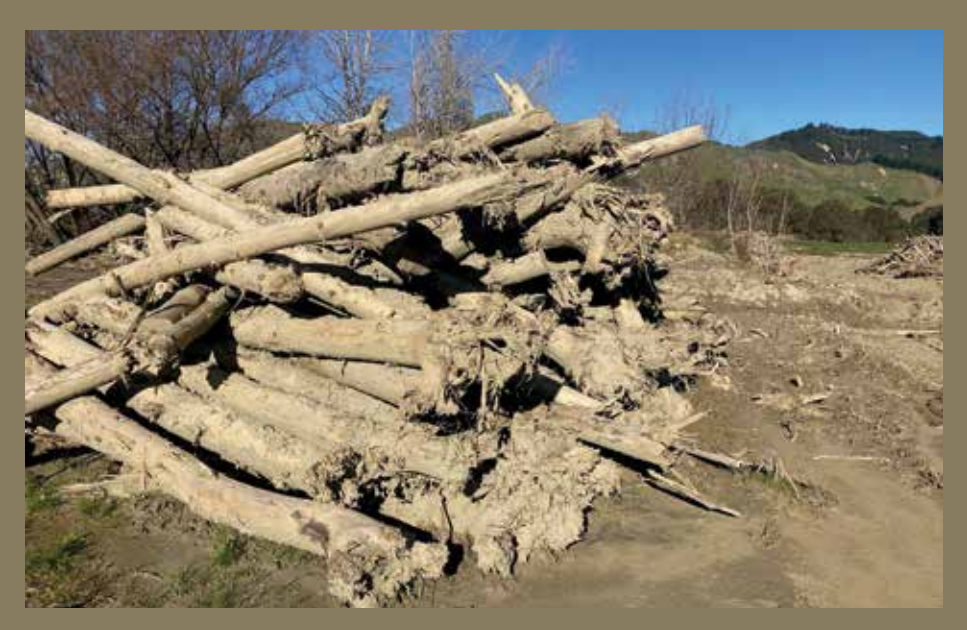
Whole tree stems dragged out of the Waimata River during the post-Gabrielle clean up

As a result, the Council is on a fast track for developing forest management rules