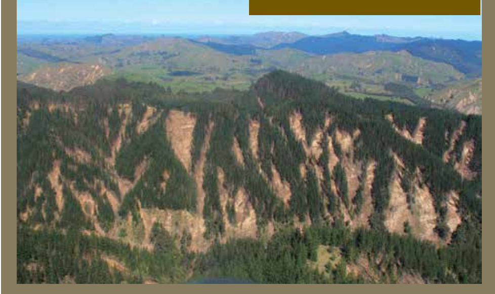
Before Gabrielle, this hillside was covered in mid-rotation radiata forest. Landslides have removed the topsoil, trees and all, down to bedrock in many places

Many of the forests in Tairawhiti are in their first harvest cycle. When they are harvested, some of the steeper slopes are already being retired from forestry at the initiative of the forest owners, but largescale retirement and planting in